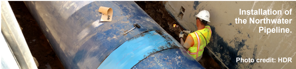
Installation of the Northwater Pipeline.

Starting in March 2020, crews will begin open trench work in Fairmount, Jefferson County for the Northwater Pipeline. Crews will cross over four canals and cross over four roads to install the pipeline. More project details can be found at denverwater.org/northsystemrenewal .